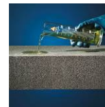
Acid resistant / chemical resistant