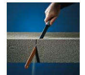
Easy cut to shape